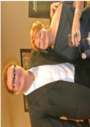
Catching up on Netball happenings with former Chicago Bulls 7 foot 2 Luke Longley.