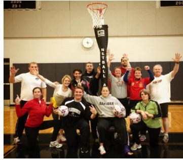
Teachers from New Hampshire enjoying a day of Netball.

November 8-10 - U.S. Open, Atlanta, Georgia