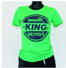
$20 womens tee