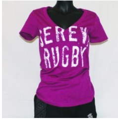
$20 womens tee