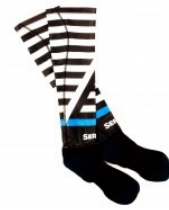
Rugby socks - $15