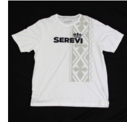
Tshirt $20. Also avail in black