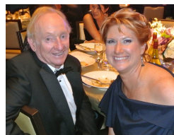
Both Rockhampton hometown heros - President of Netball America with Tennis Hall of Famer Rod Laver