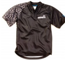
Training Shirt $70. Also avail in white