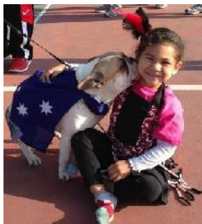
NZ Mascot getting a cuddle from the Oz Mascot 'Puddy' at International Day