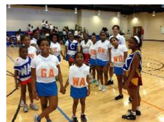
Atlanta Youth after their games at Crusaders ATL Rally